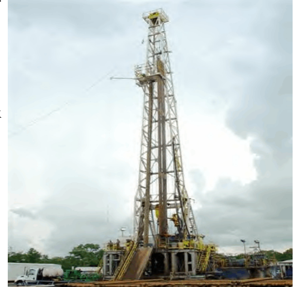
1. Drilling Rig, New Mexico.

technology included hydraulic fracture treatment of perforated long string casing using a variety of gelled fluids to emplace sand proppant into the fractures. DOE indicated that acid treatments and acid fracture treatments are frequently used and assumed that all oil- and gas-related boreholes in the area will be plugged according to current applicable regulations. CCA Appendix DEL.6.2.3 (p. DEL-71) discussed post-1988 boreholes declared shut-in or temporarily abandoned that have been plugged. This is consistent with data indicating that 100 percent of the wells drilled since 1988 were plugged or are in the process of being plugged to meet standards (Appendix MASS). The Agency examined the air drilling issue from several perspectives and documented its findings in the CCA TSD EPA's Analysis of Air Drilling at WIPP (EPA 1998b) and in CCA Response to Comments, Section 8 (Docket A-93-02, V-C-1).