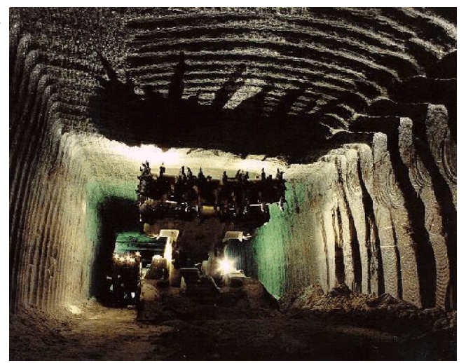
Figure 4. Marietta Drum Miner at WIPP

The Agency's review of minable reserves found that DOE reasonably identified current