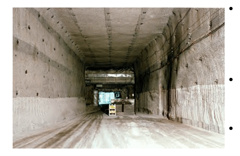
Figure 5. Experimental Gallery at the WIPP.